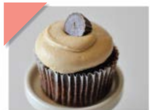
CHOC. PEANUT BUTTER