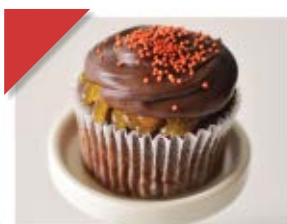
JUST ABOUT DECADENT